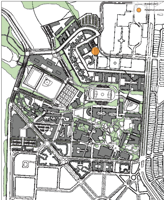
Satellite Plant Location Map

The existing central plant will remain in service and a satellite plant will be developed at the north end of campus to accommodate the growth in demand. Generally, the northern plant will house equipment to meet the demands of the area of campus north of the valley, and the existing central plant will be utilized to meet increased demands to the south. The two plants will tie to the same electrical distribution system making it possible to share loads, if needed, and provide additional redundancy to the system.