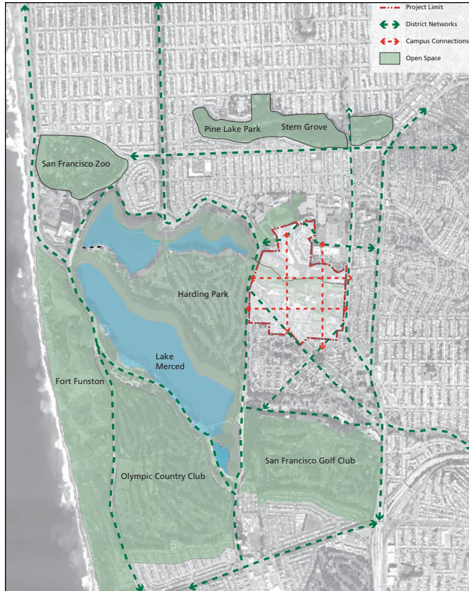
District Connectivity. The campus circulation network can help fill gaps in the district network, enhancing access to district open space.